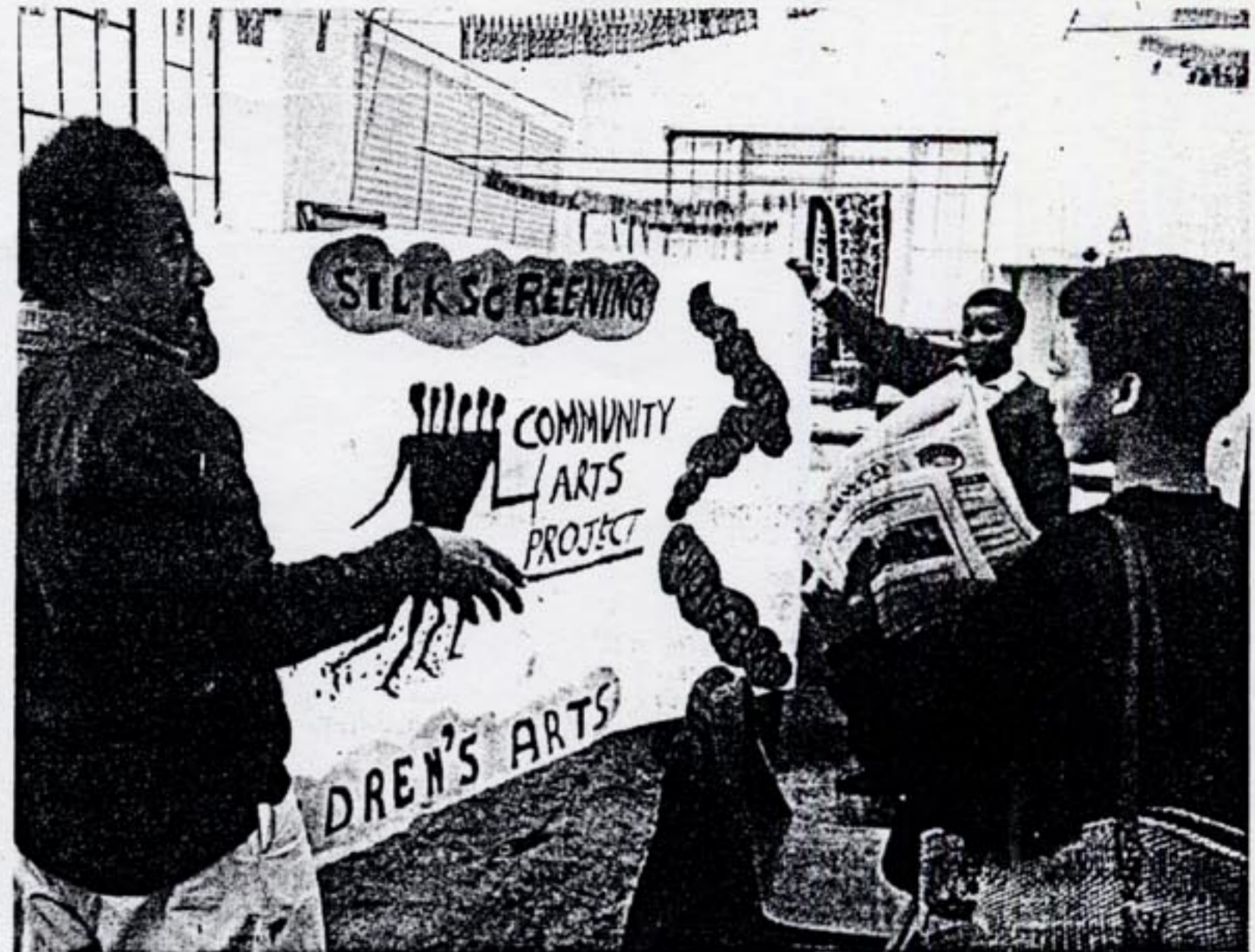
# Cap offices will be a bustle of activity for both the young and old

Applications should reach The Administrator CAP, PO Box 13140, Sir Lowry Rd, 7900 by December 14 1990. Applicants will receive replies by January 28 1991.