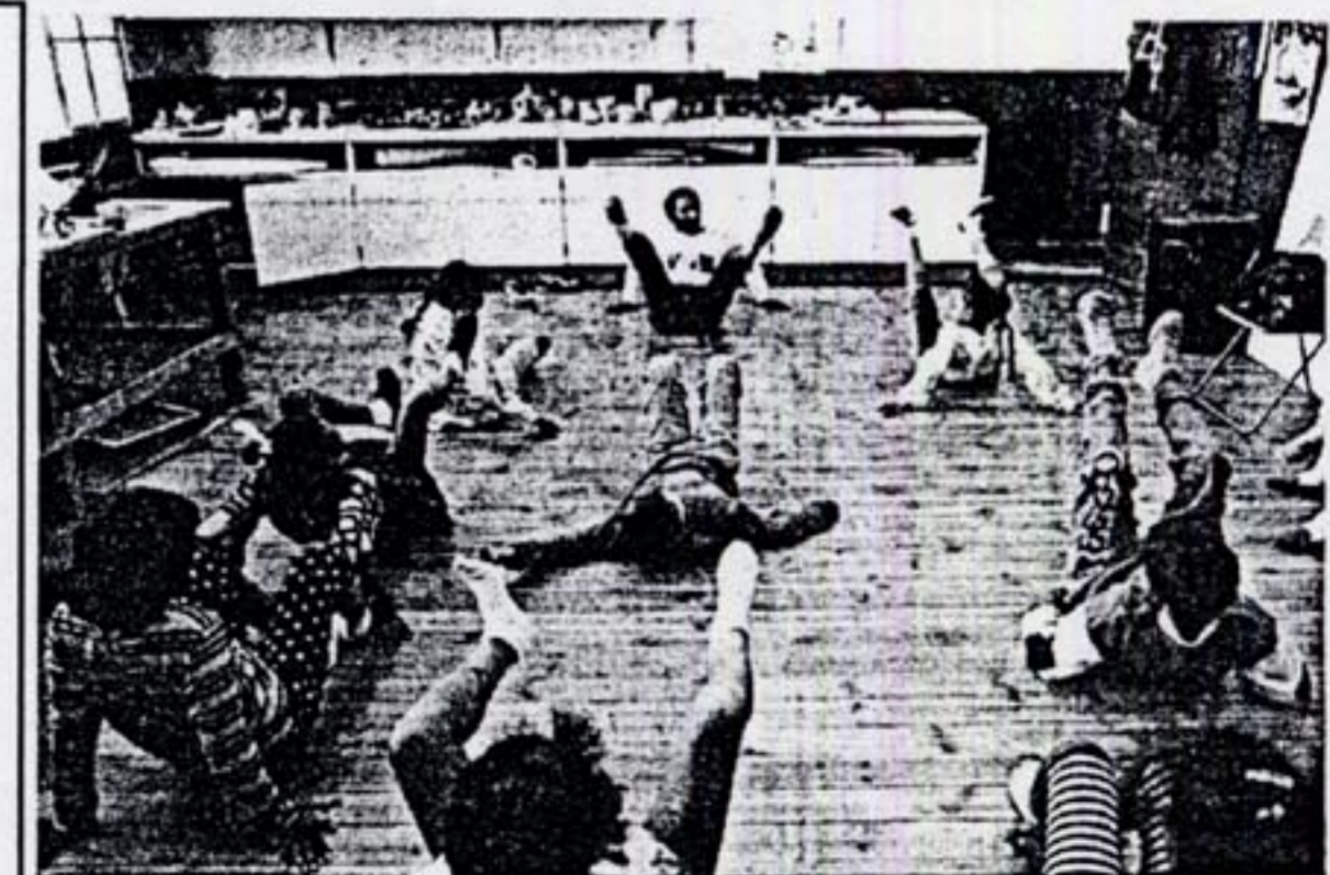
Children will be incorporated in drama and movement classes