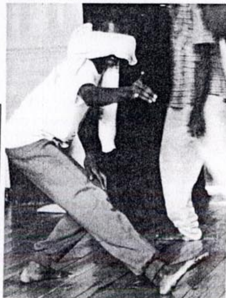
# Fancy footwork