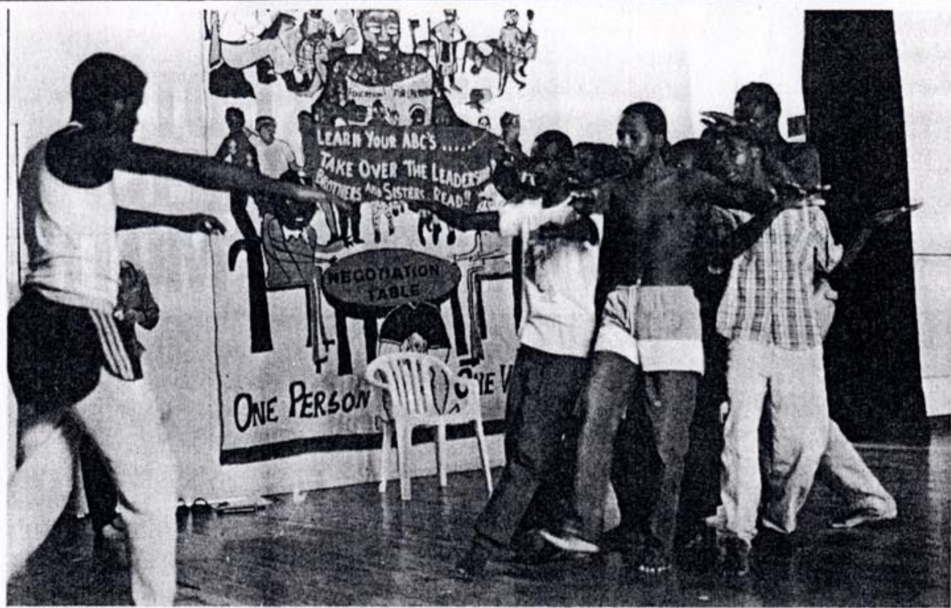
# Workers put their skills into action on the Community Arts Project (CAP) dance floor